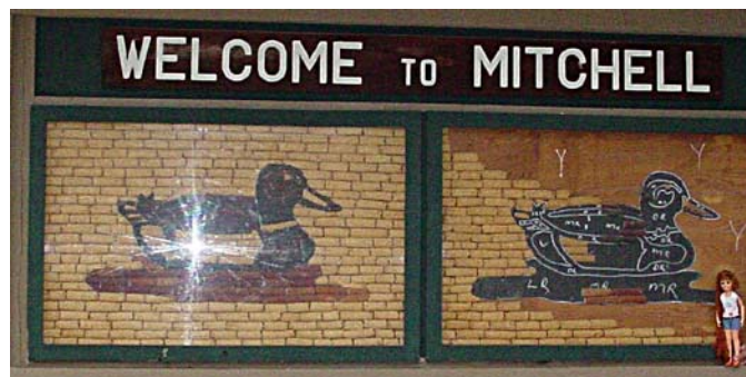
Here I am by a mural that shows how the murals are made. It's like a paint by number—only with corn.