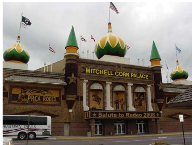
The theme this year is "Salute to Rodeo".

Today we are driving to Mitchell, SD, home of the World's only Corn Palace. It is about 75 miles from Sioux Falls. The original Corn Palace was established in 1892 and called "The Corn Belt Exposition". Early settlers displayed the harvest on the building to show the fertility of the soil in SD. Now they are beautiful murals that are torn down and re-designed annually. The only years that were duplications were during wartime, and extreme hardship.