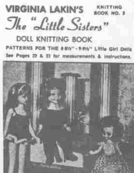
Book 5 — Knitting for 8, 8 1/2, 9, 9 1/2" "little sister" dolls.