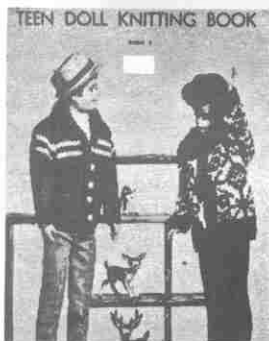
Book 2 — Knitting patterns for boy & girl teen doll.