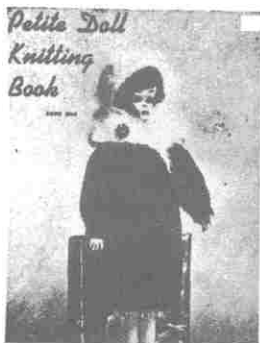
Book 1 — Knitting patterns for girl teen doll.