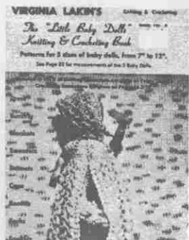
Book 6 — Knitting & crocheting patterns for 7 to 12" baby dolls.