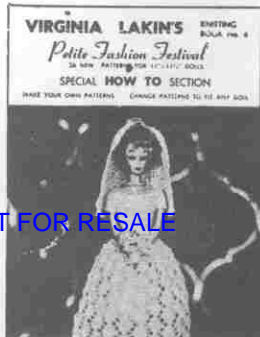
Book 4 — Knitting patterns for girl teen doll, plus many helpful hints.