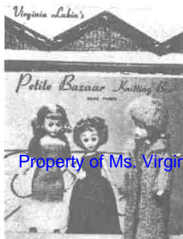
Book 3 — Knitting patterns for 8, 9, 10 & 12" dolls.